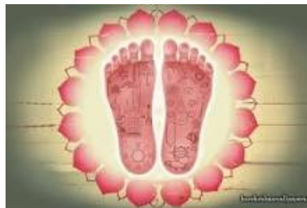
The Lotus feet of Shree Krishna Caitanya Mahaprabhu

Caitanya Mahaprabhu left only eight shlokas (verses) of His instructions in writing, and they are known as the Shikhsaa-shtaka (which are given below). These eight verses are the condensed version of all the Vedas, Puranas, Bhagavad Gita, and other Vedic scriptures combined. That's why it is so important - and yet very few people are aware of it. The movement started by Mahaprabhu is richer than any other, and it is the living religion of the day with the potency for spreading as the universal religion.