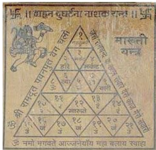
Vahan Durghatna Nashak Yantra

*** The 'Vaahan' is vehicle and 'Durghatna' is accident. As the name denotes, this Yantra ensures protection from accidents, injury, or other mis-haps, especially those related to vehicles. It acts as a shield to protect and save the worshiper from any such mis-fortunes, and ensures his own, his family's and his belonging's safety during journeys.