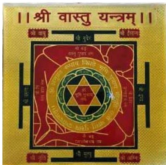
Shree Vaastu Yantra

Vaastu Shastra is the "science of construction", "architecture" and is a traditional Hindu system of design based on directional alignments. It is primarily applied in Hindu architecture, especially for Hindu temples, although it covers other applications, including Houses, poetry, dance, sculpture, etc. Today Vaastu Shastra is making a come back because its offshoot "Feng Shui" is the hot topic everywhere. Vaastu shastra has been practised since time immemorial in India.