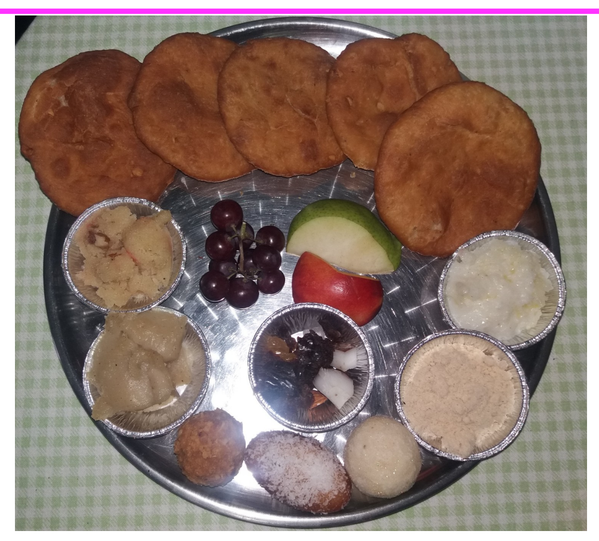
(On the tray above is (top) 3 or 5 Rhot, (left side) a foil tray of Soorjee, Halwa, on the right side a foil tray of Sweet rice (kheer), panjeri, in the middle of the tray is 3 kinds of fruits and a foil of coconut and dates and in the front of the tray is 3 kinds of Mittai (sweets). (Kindly note that is just an example and you may adjust accordingly.)