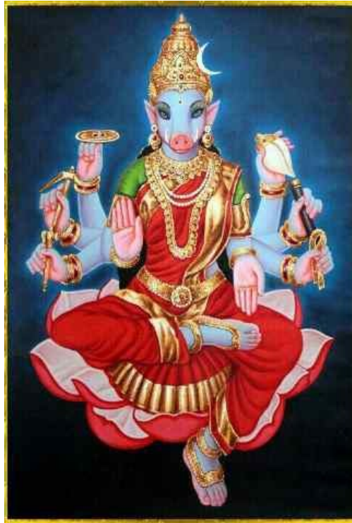
Varahi-devi (a.k.a Mother Earth/Bhumi-devi/Dharthi-devi)

of his family lineage (kul) he is considered to be wedded to that female. Thank goodness this custom is forbidden in Kali-Yuga. So when Lord Varaha-deva picked up the earth, Mother Earth then assumed the name of Srimati Varahi-devi, the consort of Lord Varaha-deva. Varahi-devi is also one of the 8 Devi's that assisted Mother Durga in the Durga Paath to destroy the powerful demonic forces.