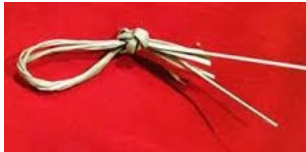
Darbha (Kush) Ring

The following ingredients are added to the water in the Tarpan container/dish: milk, jau (jaw/barley), red water perfume, sugar/gur, honey, and flower petals, (optional constituents – a little white, unbroken rice and a drop of ghee). Black til is added to the mixture only when the ancestors names are being chanted. The Tarpan mixture looks more like a milkshake, so to speak. A ring made of darbha (view the picture below), known as pavitram, is to be worn on the right hand ring finger during the ritual.