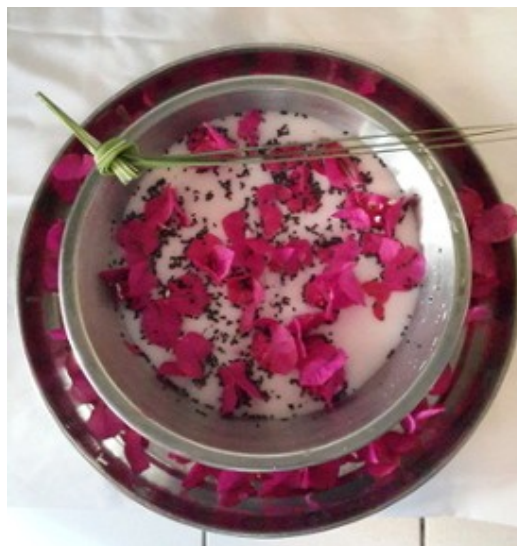
A dish containing the Tarpan ingredients.

In the years gone by, most of our ancestors used to offer tarpan left, right, forward, backwards, and bottom directions. This is not correct. The correct method is that the tarpan MUST be offered in the dish/container. There are two ways of positioning yourself when offering Tarpan, firstly you can face east and offer the tarpan forward or you can remain in one position and offer the water tarpan either east, north or south (by tilting one's hands and releasing the tarpan water in an easternly/northerly/southernly direction, as opposed to re-positioning oneself to face forward (East/North/South) during the tarpan). Now that that is explained, I shall elaborate on why the Tarpan is offered into the dish/container instead of directly onto the planted,