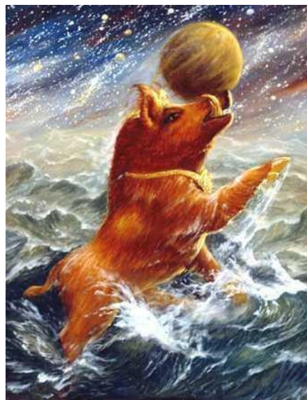
Lord Varaha-deva (a.k.a. Lord Vishnu, Lord Narayana, Lord Krishna, Lord Raam)