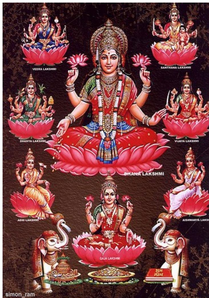
Ashta Lakshmi (The 8 Lakshmi forms)