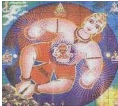
diagram below, known as Vaastu Mandala, illustrates how Lord Brahma pinned down the Vaastu Purusha and the 32 devas - face down, with his head to the North East and feet towards South West. It is divided in to 9 \times 9 = 81 parts. These devas rule various aspects of life and have certain inherent qualities.}