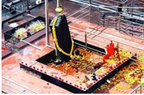
Shrine at Shani Shingnapur

A very important Shrine for Lord Shani is in Shani Shingnapur, Maharashtra, India. The deity here is "Swayambhu" (self-evolved deity) that is self emerged from earth in form of black but imposing stone. Though no one knows the exact period, it is believed that the Swayambhu Shanaishwara statue was found from times immemorial by shepherds of the then local hamlet. The katha of the swayambhu statue was handed down from generations through word of mouth, and goes something like this: When the Shepherd touched the stone with a pointed rod, the stone started bleeding. The shepherds were astounded. Soon the whole village gathered around to watch the miracle. On that night Lord Shanaishwara appeared in the dream of the most devoted and pious of the shepherds. He told the shepherd that he is "Shanaishwara". He also told that the unique looking black stone is his swayambhu form. The shepherd prayed and asked the lord whether he should construct a temple for him. To this, Lord Shani Mahatma said there is no need for a roof as the whole sky is his roof and he preferred to be under open sky. He asked the shepherd to do daily pooja and 'Tailabhisheka' (oil bath) every Saturday without fail. He also promised the whole hamlet will have no fear of dacoits or burglars or thieves.