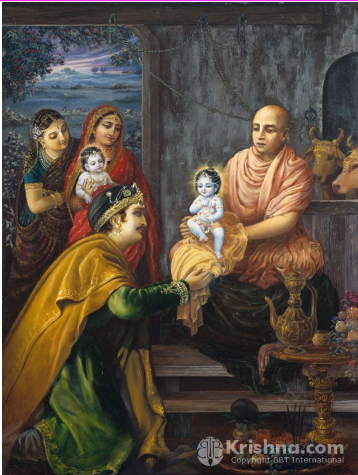
The Naming Ceremony of Lord Krsna performed by Garga Muni***

Sastras again and again stress the importance of astrology. Srimad Bhagavatam 10.5 states, “after the birth of baby Krsna, Nanda Maharaja called for learned astrologers and Brahmins to perform the birth ceremony. After the birth of the child the astrologers thereafter calculated the moment of the birth and made a horoscope of the child’s future life”